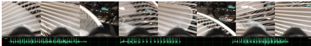
Figure 4: A recorded visual and tactile experience: an electric fan cover