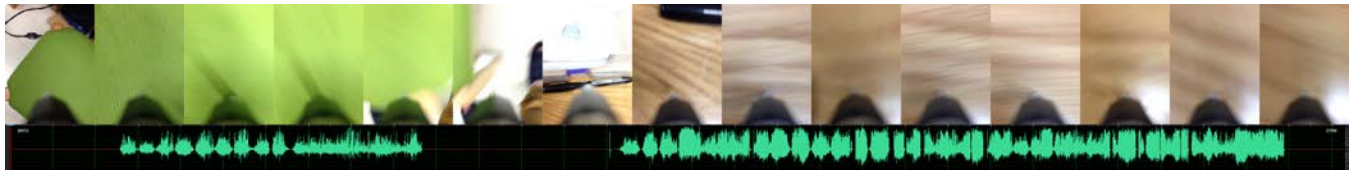
Figure 1. Recorded image thumbnails and tactile wave table