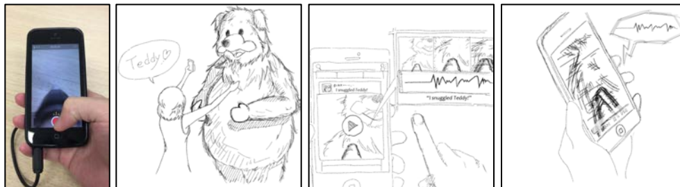
Figure 2. An iPhone with the a(touch)ment haptic device in use. Right: Examples of experiences that may be captured and shared by recording video with accompanying tactile sensation using a(touch)ment.