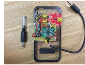
Figure 3: Appearance of a(touch)ment

fig. 4 and 5, the haptic information corresponding to the video can be experienced.